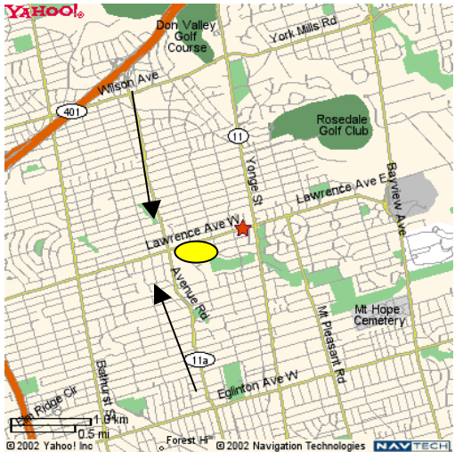
Note – Do not confuse this school with Havergal Girls school – they are not the same facility. Havergal's fields are visible from Ave and Lawrence – keep driving to Yonge to see Larence Park Collegiate.